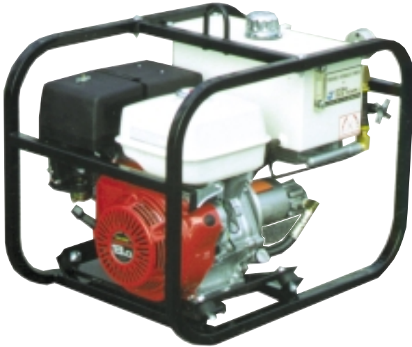
Unit Shown with Standard Roll Cage Wheel Kit is Available

This Honda powered gas power pack is ideal for driving our 3" pumps and even our 6" propeller pump. It also can provide hydraulic power to run many other hydraulic tools now available.