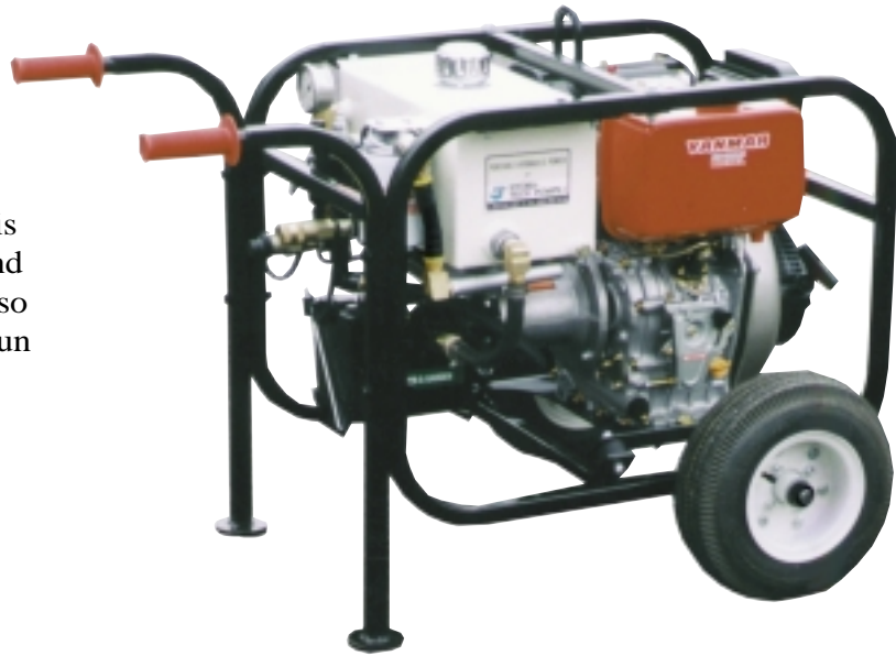
Unit Shown with Optional Wheel Kit

This portable diesel power pack is ideal for driving our 3" pumps and even our 6" propeller pump. It also can provide hydraulic power to run many other hydraulic tools now available.